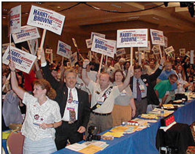
Delegates cheer during Browne's acceptance speech